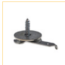
5. Hidden Ceiling Bracket