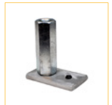
6. Ceiling bracket M10