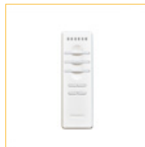
11. Remote Control