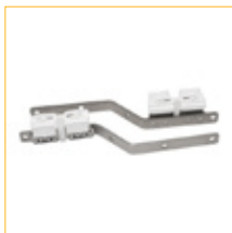
8. Overlap Carrier Set