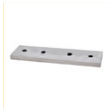
3. Joiner Plate