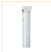
10. Rope Track Drive 400