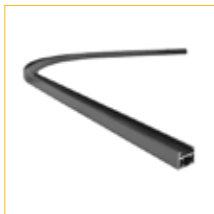
2. Curved Track 90°